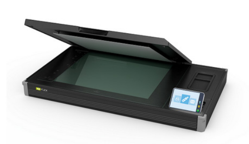
Contex Large Format Flatbed Scanner

To Unsubscribe from our Newsletters, please email hello@scansolutions.co.uk , and we will immediately remove you from our list.